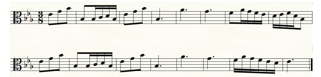
Joseph Haydn, "London" Trio Hob. IV:1, I.