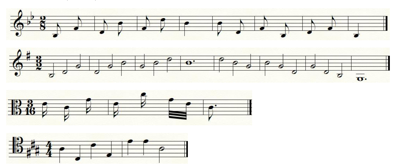
The "Find Do" Game

Step 3: check your time signature. Remember, the numerator determines whether you will conduct in two, three, or four.